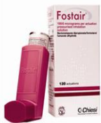
Fostair MDI or NEXT 100/6 micrograms Two puffs twice daily Beclometasone/Formoterol