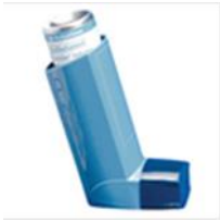
Salbutamol MDI 100 micrograms One - Two puffs as required Salbutamol