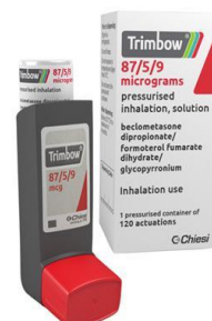
Trimbow MDI 87/5/9 micrograms Two puffs twice daily Beclometasone/Formoterol/ Glycopyrronium