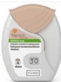
Trelegy Ellipta 55/22/92 micrograms One dose once daily Umeclidinium/ Vilanterol/Fluticasone