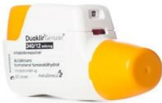
Duaklir Genuair 12/340 micrograms One dose twice daily Formoterol/Acidinium