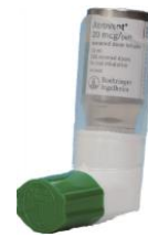
Atrovent 20 micrograms MDI One or Two puffs four times a day Ipratropium