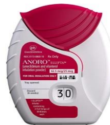
Anoro Ellipta 22/55 micrograms One dose once daily Vilanterol/Umeclidinium