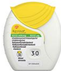
Relvar Ellipta 22/92 micrograms One dose once daily Vilanterol/Fluticasone