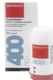
Symbicort DPI 400/12 micrograms Turbuhaler One dose twice daily MDI 200/6 micrograms Two puffs twice daily Budesonide/Formoterol